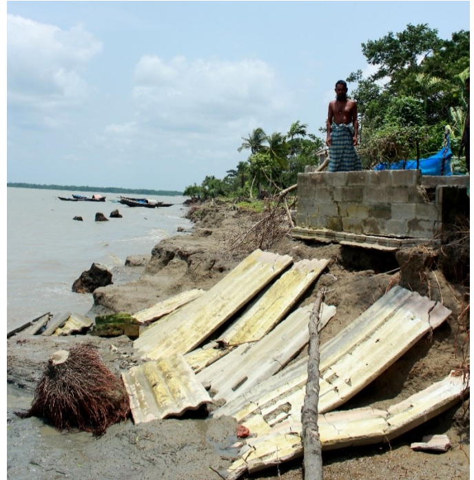
Makher Char, Pirojpur, Bangladesh, 2017.

Women are also facing increased incidences of domestic violence due to displacement not only in shelters but also on account of being forcefully displaced to a new location often far away from the family structures. Moreover, human trafficking of women and girls are also on the rise in most countries, where young girls and women are forced to work as sex workers and domestic help.